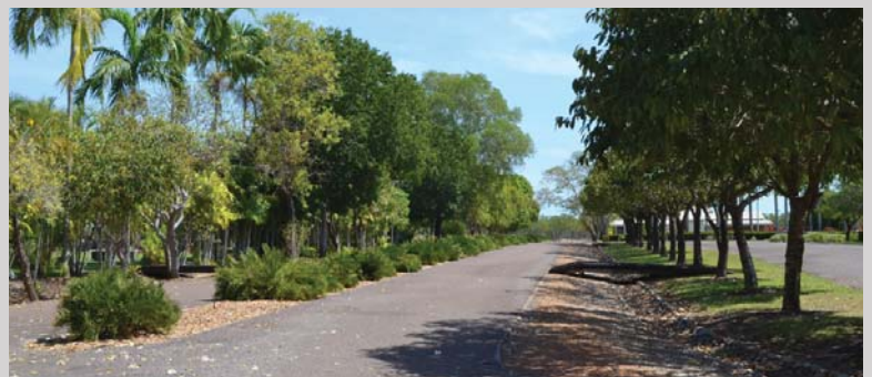
Image: Entry Road