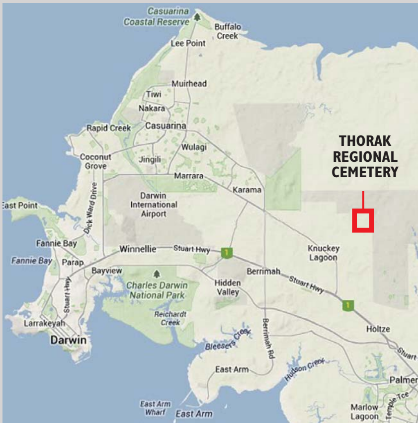
Map of Thorak Regional Cemetery and surrounds.

Location: 95 Deloraine Road, Knuckey Lagoon, Litchfield, Northern Territory.