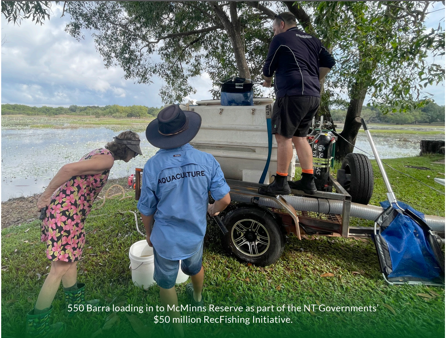
550 Barra loading in to McMinns Reserve as part of the NT Governments' $50 million RecFishing Initiative.